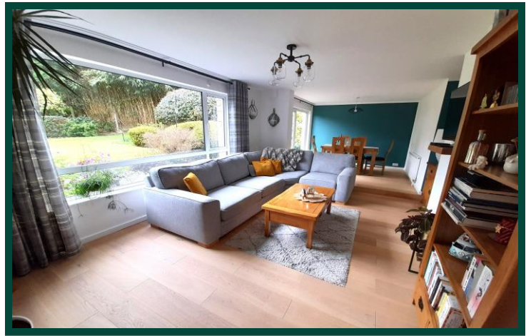
Lounge into Dining Room