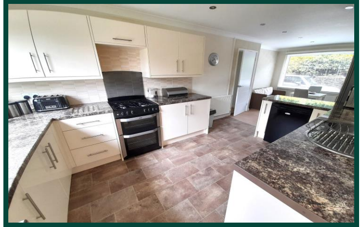
Kitchen Breakfast Room